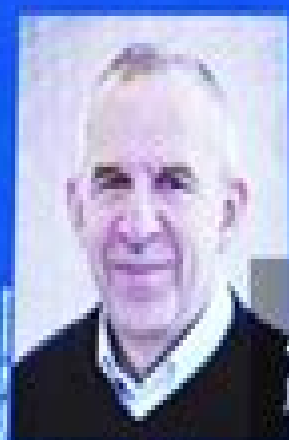
Michel H. Devoret

Yale University & University of California, USA