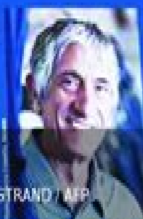
John M. Martinis

Yale University & University of California, USA