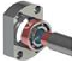
Rotary Bearing Fit Calculation Software