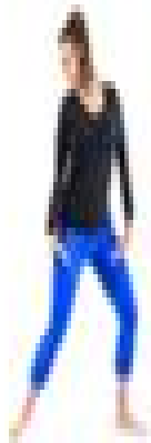
5. Turn and release