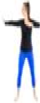
2. Draw the bow