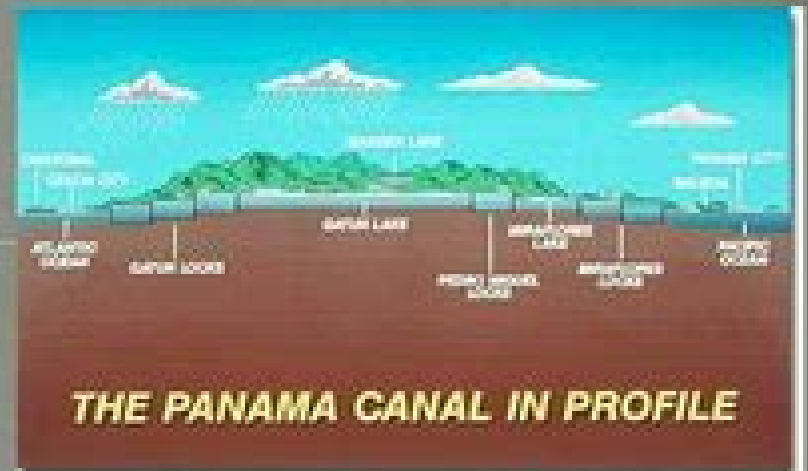
Figure 3: A map showing the route of the completed canal. A series of "locks" are used to control the water level within the canal.