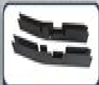
B0CJ4XH4KM Reg Cab Long Bed