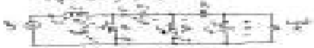
Fig. 2.2.1 a) 100