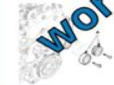
27. Remove the timing chain auto tensioner(A)