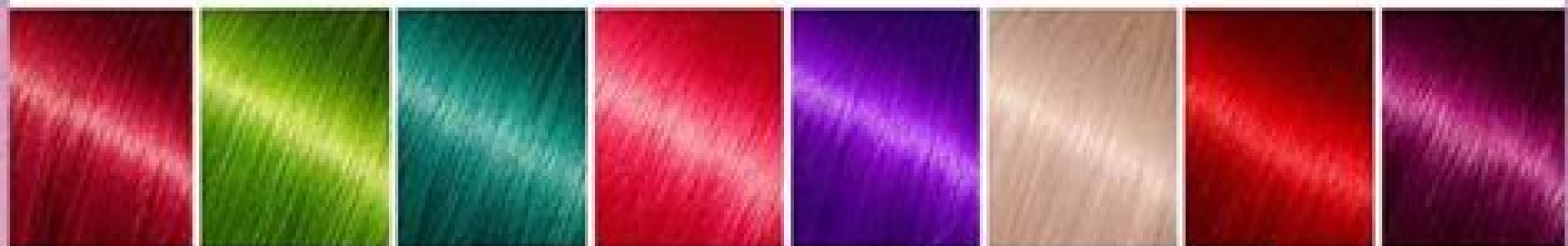
Burgundy Bistre Green Grape Mystic Turquoise Pink Pearl Purple Passion Rosa Rosa Ruby Red Ultra Violet