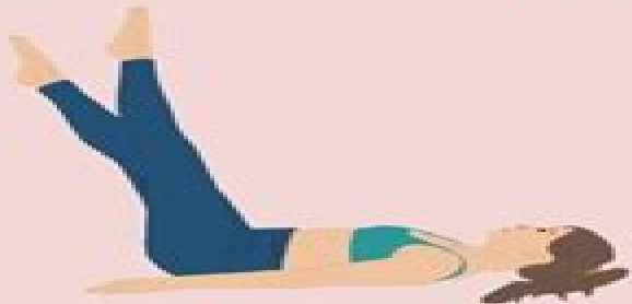
5. THE HUNDRED