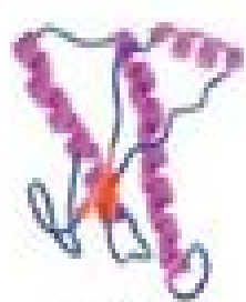
NORMAL HUMAN PROTEIN

Creutzfeldt-Jakob disease is caused by abnormal proteins called prions that are not killed by standard methods for sterilizing surgical equipment.