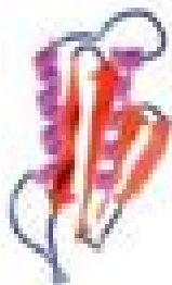
DISEASE- CAUSING PRION

As prions build up in cells, the brain slowly shrinks and the tissue fills with holes until it resembles a sponge.