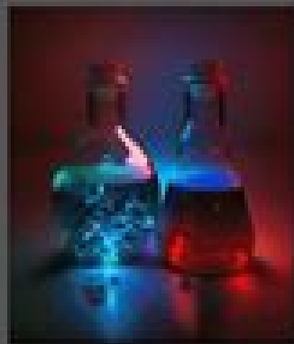
color change chemiluminescence