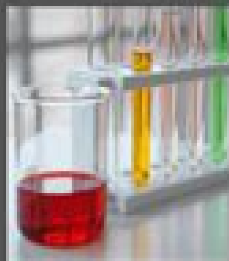
traffic light reaction