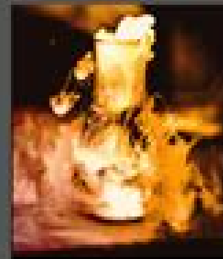
sodium in water