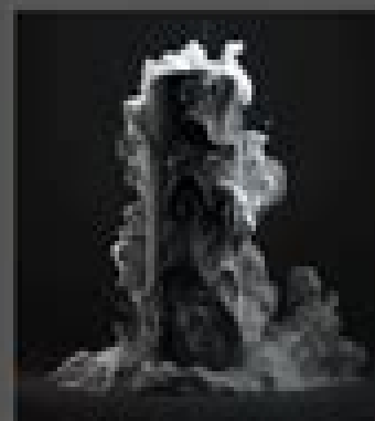
sugar and sulfuric acid