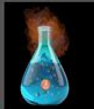
copper and nitric acid