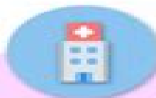
BARANGAY HEALTH STATION