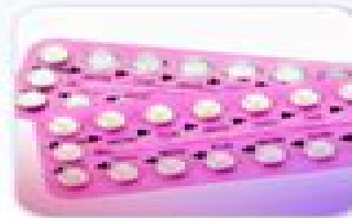
PROGESTIN ONLY PILLS (POP)