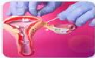
LIGATION (UNILATERAL OR BILATERAL)