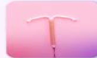
INTRAUTERINE DEVICE (IUD)