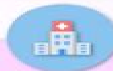
RURAL HEALTH UNIT O HEALTH CENTER