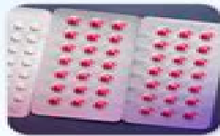
COMBINED ORAL CONTRACEPTIVE PILLS (COC)