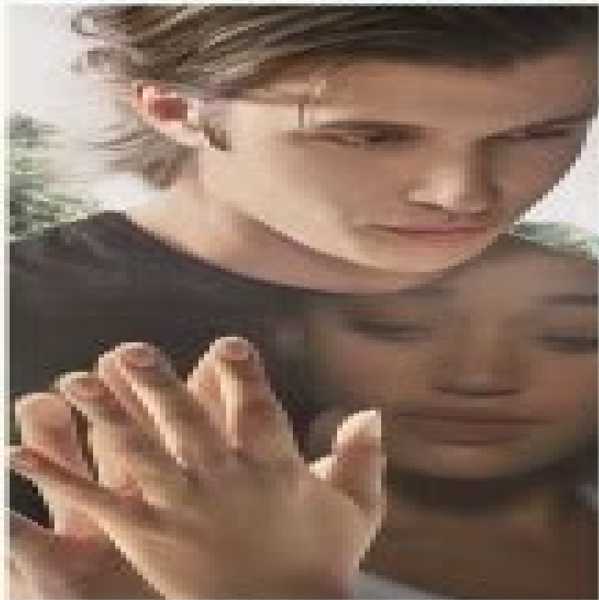
David Duchovny: Tutta... Per Amore.

Il nuovo film della Warner Bros. con il nuovo Mark Twain.