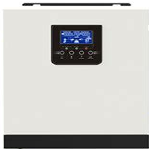
Off Grid Solar Inverter