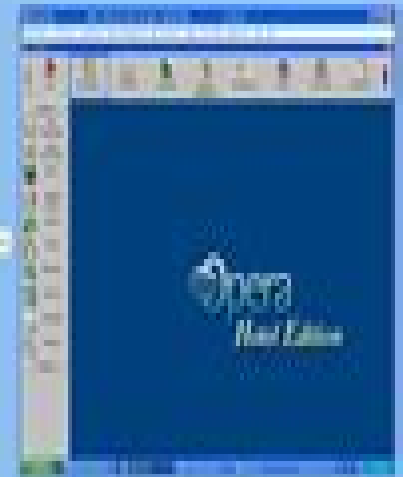
Opera Next Edition