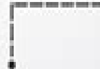
Switch Cisco L2