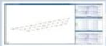
Steady State and Harmonic Response Analysis

Addressing the increasingly complex global seismic requirements as well as the need to integrate the wide array of tools used by professional structural engineers, STAAD.Pro 2006 continues to be the world's most widely-used, customizable and user-friendly structural solutions software. STAAD.Pro 2006 is a combination of a robust 3D multi-material structural modeler with a powerful analysis and design engine capable of solving the most complex linear elastic, soil-structure interaction, dynamics and plastic analysis problems. Over 20,000 structural engineering firms from around the world have used STAAD.Pro's exhaustive design tools for steel, concrete, timber, aluminum and composite sections to design low- and high-rise buildings, petrochemical and industrial plants, towers, bridges, foundations, culverts and much more. Intelligent modeling and interoperability empower structural engineers to use powerful structural objects like floors (composite or non-composite), slabs, joints, shear walls and bridge decks to assemble, analyze, design and connect their structure in one integrated environment.