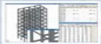
Optional Pushover Analysis per FEMA 356/440