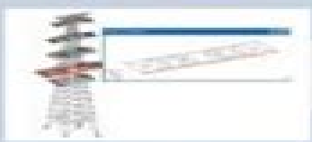
Model with Physical Dimensions