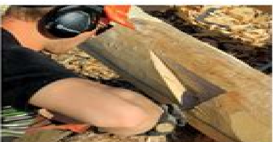
Figure 26: Cleaning out half of a joint. Note the lines on the top that are for tenon layout.

for example). The tenons, and the mortises to match them, are laid out from the chalklines / centerlines that you snapped on every log in the truss.