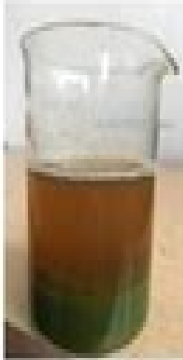
Isoelectric precipitation of protein concentrates

Centrifugation (5000g, 10 min, 4°C), pH of supernatant adjusted to 4.5