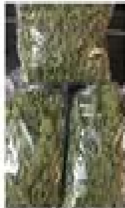
Dried radish leaves

De-stemming, washing with deionized water, drying of leaves