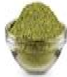
Radish Leaf Powder