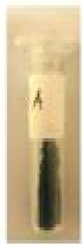
Radish leaf protein concentrate (RLPC)

Centrifugation (1000g, 10 min, 4°C), discard supernatant, wash & lyophilize precipitates