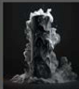
sugar and sulfuric acid