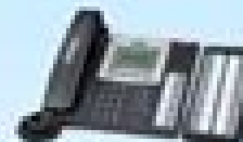
VIP-6040PT VIP-EXT-40 VIP-5060PT VIP-EXT-26