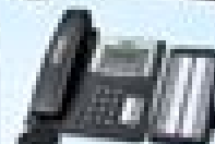
VIP-2020PT VIP-EXT-26 VIP-1010PT