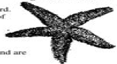
Fig 1 - Aboral Surface