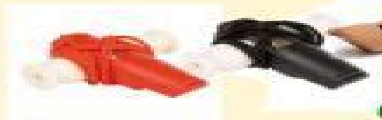
Flauto a cursore