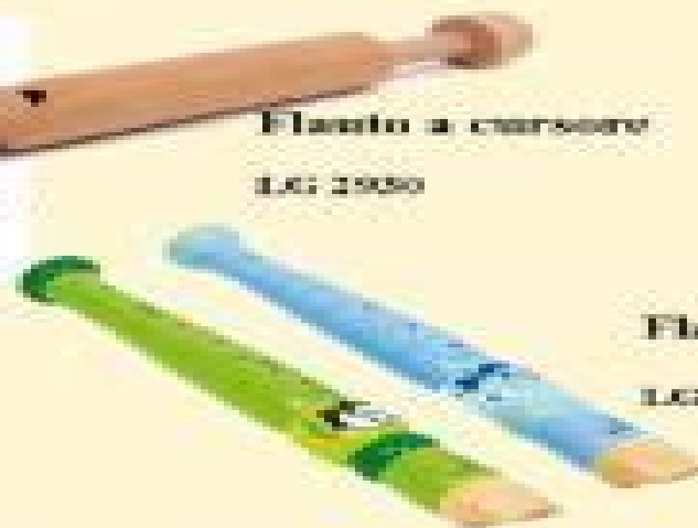
Flauto in legno