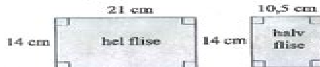
Figur 1 (skitse)

Lucas og hans far vil bruge fliser, der har mål som vist på figur 1. Fliserne skal ligge i det mønster, der er påbegyndt på figur 2.