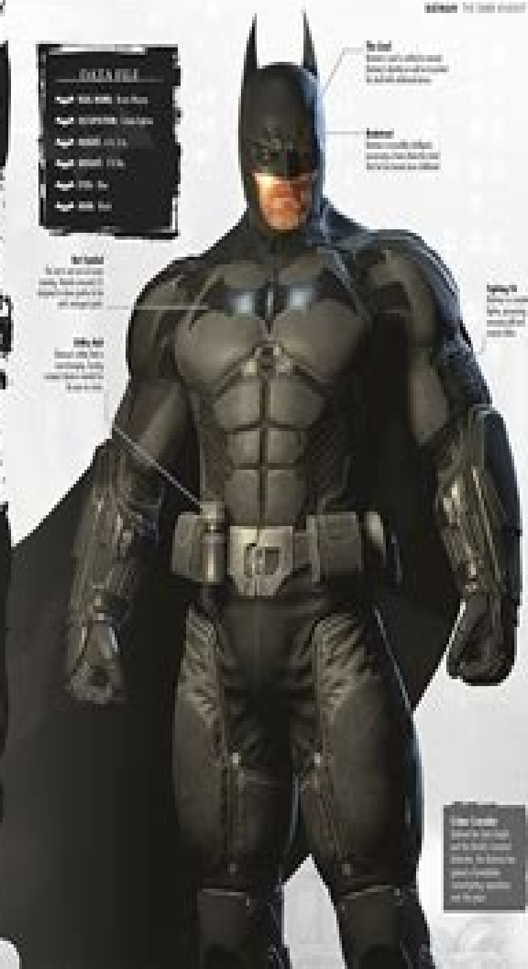
The Bat The bat is a symbol of fear and intimidation. It is a creature that is often associated with darkness and the unknown. Batman uses the bat as a symbol of his identity and as a way to inspire fear in his enemies.

THE BAT The bat is a symbol of fear and intimidation. It is a creature that is often associated with darkness and the unknown. Batman uses the bat as a symbol of his identity and as a way to inspire fear in his enemies.