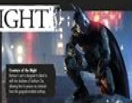
Colors of the Night Bruce's suit is made of a special material that is designed to be invisible to night-vision cameras.

He realized that in order to make a difference, he needed to be a part of the police. Instead of joining a criminal and trying to be a vigilante, he decided to join the police and use his skills to help the innocent. He believed that in order to make a difference, he had to be a part of the system. With the support and technological resources of his father's fortune, he was able to make a difference.