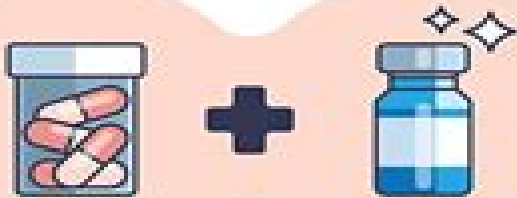
DRUG - DRUG INTERACTION