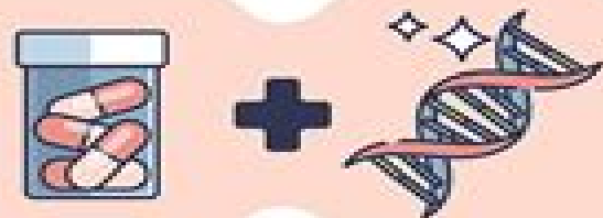
DRUG - GENE INTERACTION