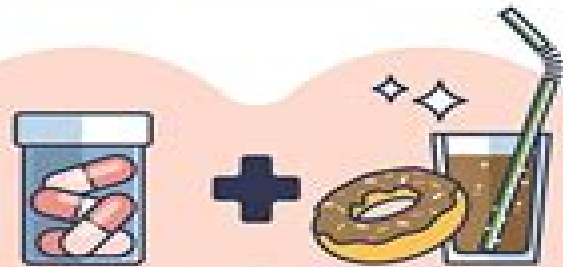
DRUG - FOOD INTERACTION