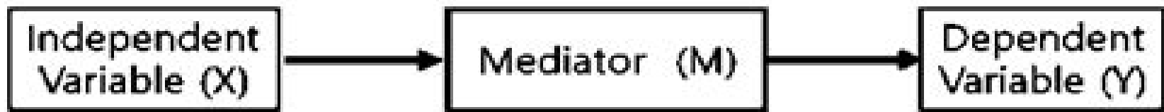
(a) Mediation Analysis