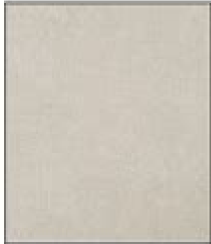
INDIANA LIMESTONE PREMIUM BUFF