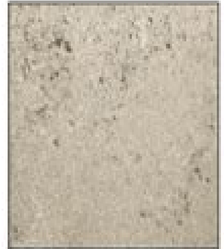
INDIANA LIMESTONE RUSTIC BUFF