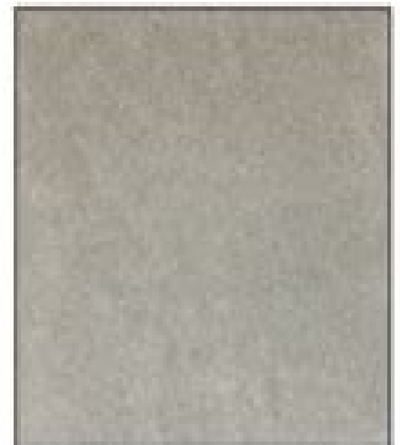
BLUESTONE - HONED BLUE/GRAY SANDSTONE