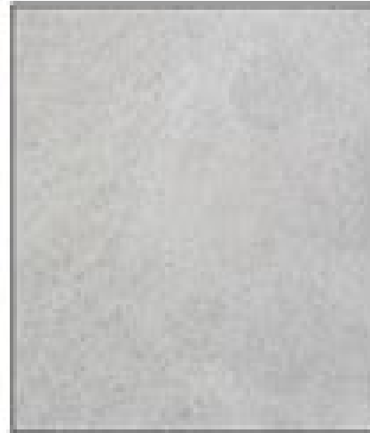
INDIANA LIMESTONE SILVER BUFF