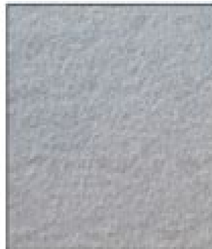
BLUESTONE - THERMAL BLUE/GRAY SANDSTONE