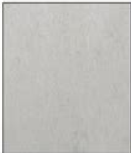
BULGARIA CREAM LIMESTONE