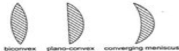
Fig. 1.1(a) Converging lenses

A lens which is thicker at its centre than at its edges converges light and is called convex or converging lens . A lens which is thicker at its edges than at its centre diverges light and is known as concave or diverging lens .