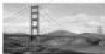
The Golden Gate Bridge

Read the selection and write the best answer to each question. The STAAR test is based on the standards for each subject. Each question is based on the standards for the subject. Each question is based on the standards for the subject.