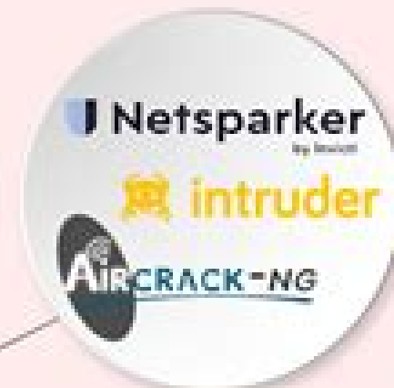
Web Vulnerability Scanning Tools