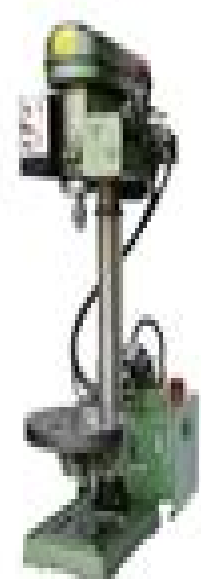
Drill press machine