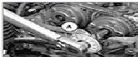
Detailed engine service, including VANOS camshaft timing adjustment, N12 Camshaft Timing Chain