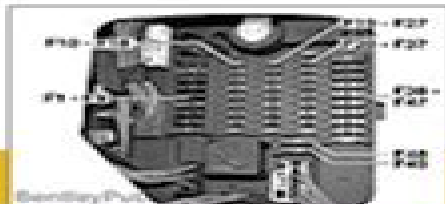
Comprehensive fuse, relay, and electrical component locations, ECU Electrical Component Locations