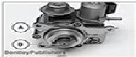
High pressure fuel system service on turbo engine, including replacing HP Fuel Pump, 116 Fuel Tank and Fuel Pump