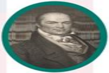
William H. Crawford