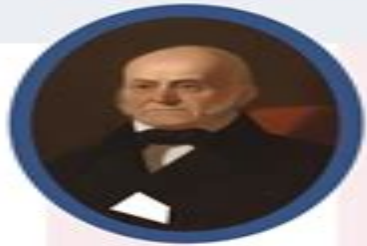
John Quincy Adams