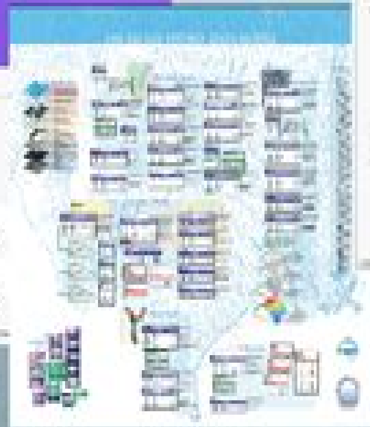
Modèle de données