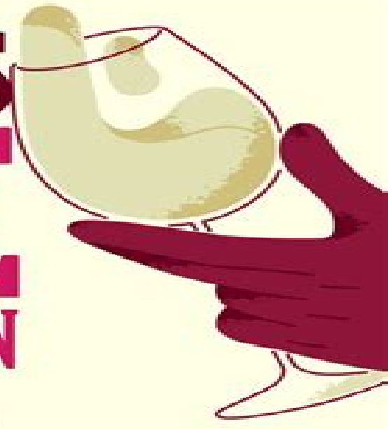
Annual Per Capita Ethanol Consumption (Gallons)