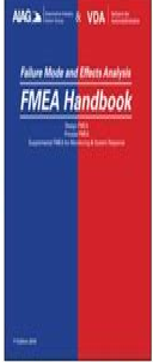
AIAG+VDA FMEA 1 st Edition