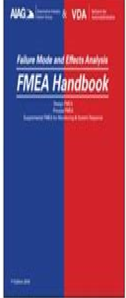
AIAG+VDA FMEA 1 st Edition