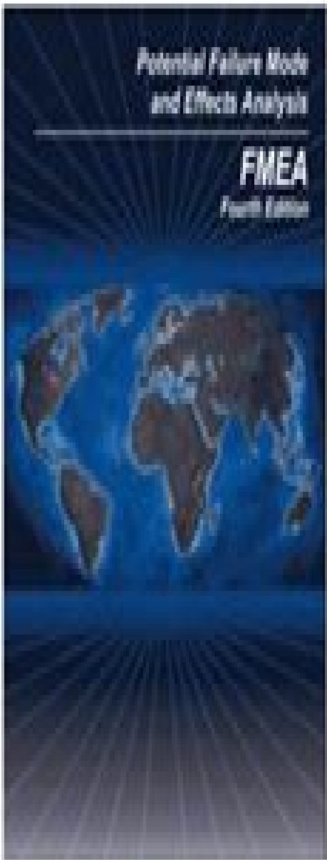
AIAG FMEA 4 th Edition