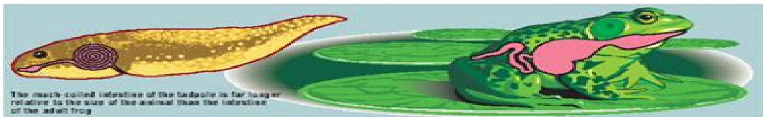
The much-coiled intestine of the tadpole is far longer relative to the size of the animal than the intestine of the adult frog

One solution is the presence of a long caecum. In carnivores, the caecum is short and has no function. The problem for herbivores is that the cellulose cell wall is a good source of nutrients, for example, glucose and animals do not have the enzyme cellulase to digest the cellulose. They overcome this problem by grinding up the food for some time and then utilising bacteria and/or protozoa that exist in the caecum and contain cellulase. Not only do the microbes digest the cellulose to glucose but they convert some of the sugar to other nutrients required by the animal. The relation between the microbes and the herbivores is symbiotic, i.e. both organisms benefit. The microbes have a constant environment containing an ample food supply. The long caecum provides a large surface area for the action of bacterial enzymes to digest cellulose and release the nutrients into the small intestine for digestion. A longer