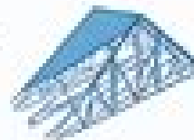
Moment-Resisting Short Wall