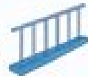
Moment-resisting Short Wall