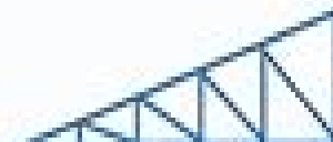
Hair Scissor Truss