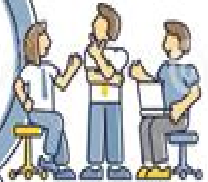
Daily Scrum Meeting