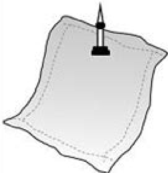
WHOLE AIR SAMPLING