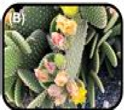
(B) Management of native and invasive plants in genus Opuntia