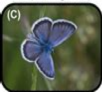
(C) Integration of spatial data for Plebejus argus & its 160 synonyms