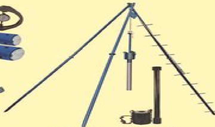
Standard Penetration Test