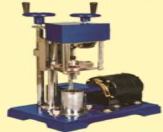
Vane Shear Test