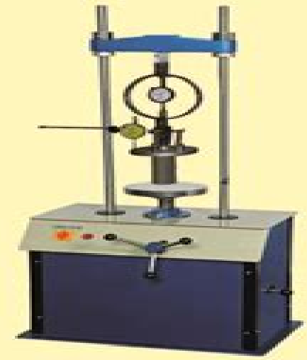
Unconfined Compression Test