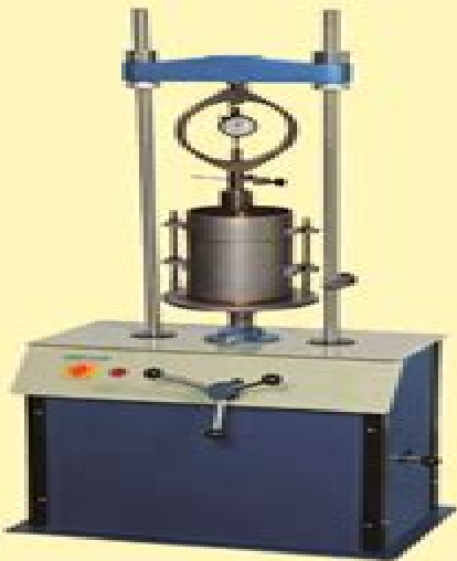
CBR Testing Machine