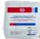
Sterile Gauze 3" (x24)