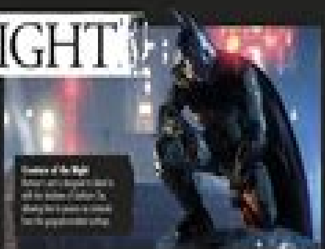
Colors of the Night The suit is made of a special material that is designed to be as light as possible while still providing protection.

justice here was rooted in money and power, money to be gained, instead of serving a common good. He was determined to bring a change and to bring a common good to his hometown. He was determined to bring a change and to bring a common good to his hometown. He was determined to bring a change and to bring a common good to his hometown. He was determined to bring a change and to bring a common good to his hometown.