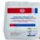
Sterile Gauze 3" (x24)