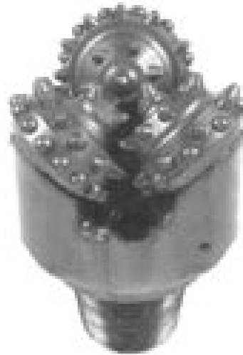
C27 IADC 527