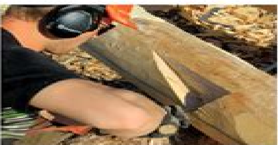
Figure 26: Cleaning out half of a joint. Note the lines on the top that are for tenon layout.

for example). The tenons, and the mortises to match them, are laid out from the chalklines / centerlines that you snapped on every log in the truss.