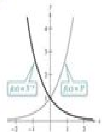
Figure 3.6 Reflection in y -axis