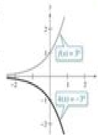
Figure 3.5 Reflection in x -axis