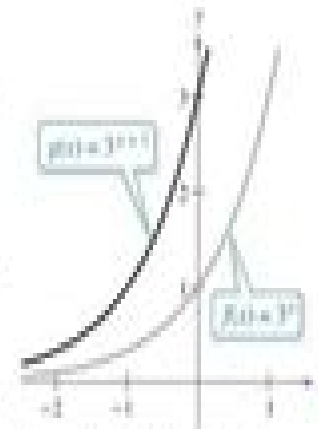
Figure 3.3 Horizontal shift